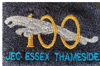
1) '100' (centenary)

To order, please contact Neil Shanley ( neilshanley@btinternet.com ) for the item(s) you require, quoting your preferred size, colour and logo