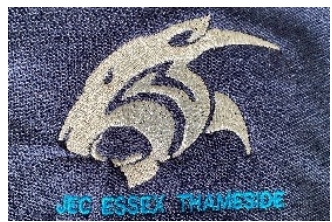
7) Style Head