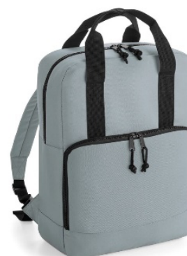
Cooler Back Pack