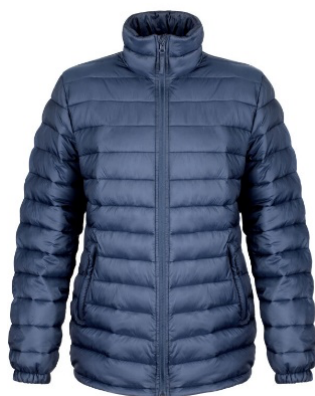
Ladies Ice Bird