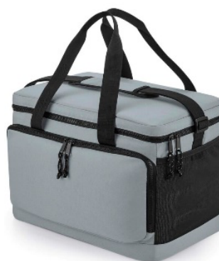
Shoulder Cooler Bag