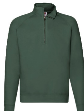
M&F Zip Neck