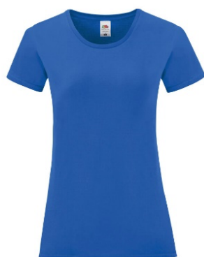
Ladies T Shirt