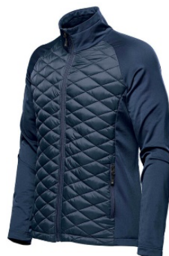
Mens Thermal Shell