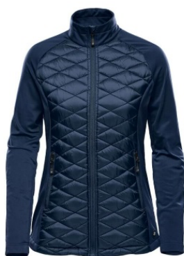
Ladies Thermal Shell