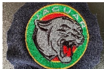
3) New Growl