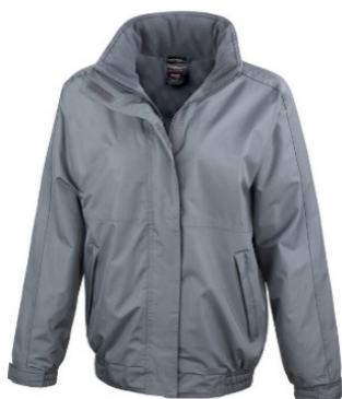
M&F Channel Jacket