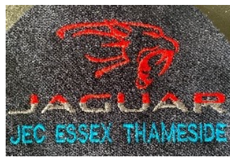
2) Red Head