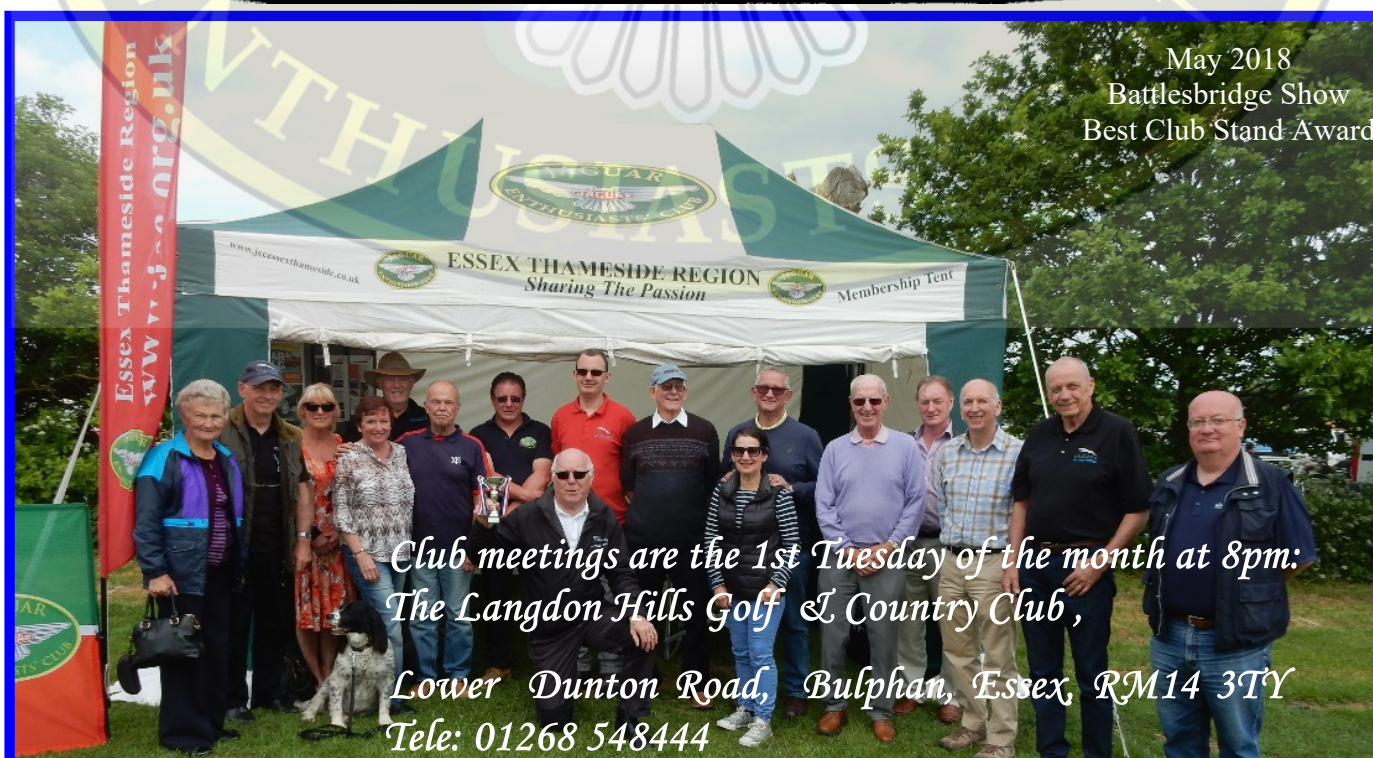
May 2018 Battlesbridge Show Best Club Stand Award

Club meetings are the 1st Tuesday of the month at 8pm: The Langdon Hills Golf & Country Club, Lower Dunton Road, Bulphan, Essex, RM14 3TY Tele: 01268 548444