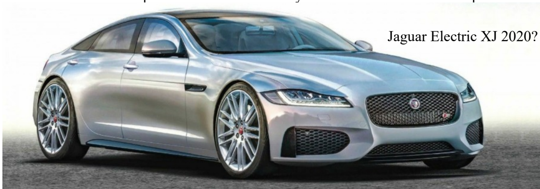
Jaguar Electric XJ 2020?

So, where will this all end up? It certainly looks as if we are being forced into driving electric cars in the future. But will the infrastructure be in place and how will the government recoup its lost revenue from fossil fuel taxes? Now there's a question! Home electricity tax increases? Watch this space!!!