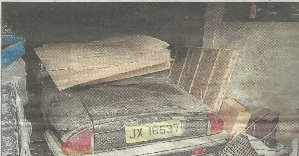
■ Discovery – the Jaguar was discovered covered in rubbish in an Epping garage

He's unsure how much he's spent doing the car up since, but had no hesitation in spending cash restoring the model.