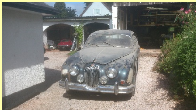
Jaguar Mk II 3.4L sees the light of day