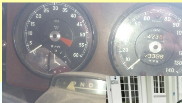
The mileage is shown at 73,358 and is known to be original