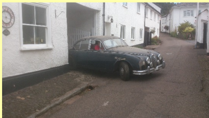
760 HFJ is driven out of its location after 37 years.