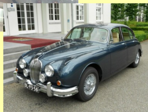
What it could look like when renovated.