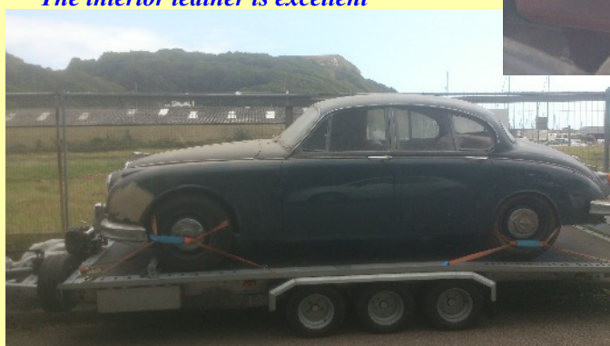
On my trailer on its way back to Essex