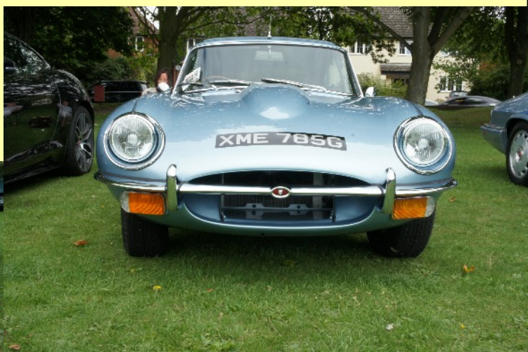
Laurence Holder's wonderfully restored E-Type