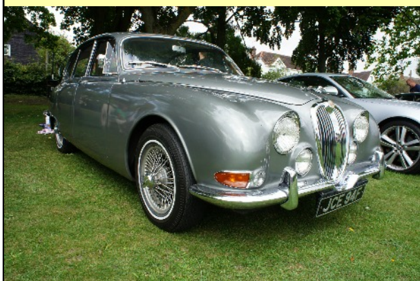
Mario Varnava beautiful S Type

A couple of members who haven't displayed their cars before, attended this show and we were privileged to see them for the first time. I do hope this will encourage them to bring there cars out again.