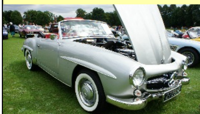
60's Mercedes 190 SL Roadster on display.

One of the cars on display was a lovely silver Mercedes 190SL (W121) Roadster produced between May 1955 and February 1963. It had obviously been meticulously rebuilt and repainted as it was in such good order and gleaming in the summer sunshine as you may see from the photo on the left.