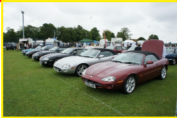
CLUB'S MEMBERS MALDON CAR SHOW