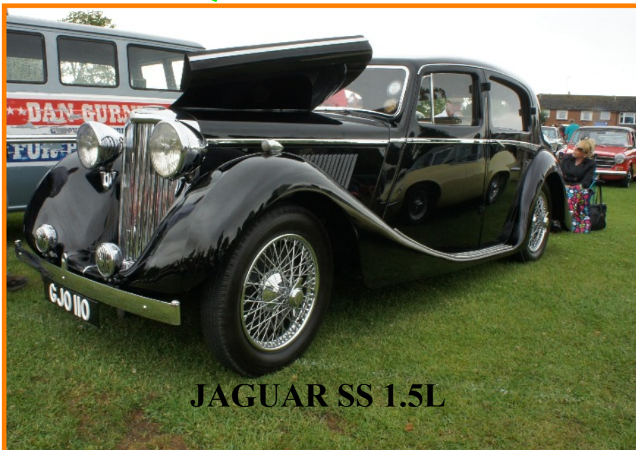
JAGUAR SS 1.5L