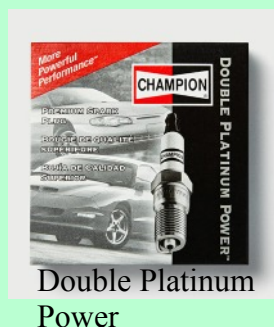
Double Platinum Power