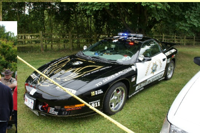
The display of American police vehicles at the Essex County Car & Motorcycle Show