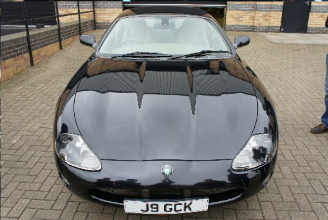
The finished car at the end of the seminar - bonnet shining in the daylight.