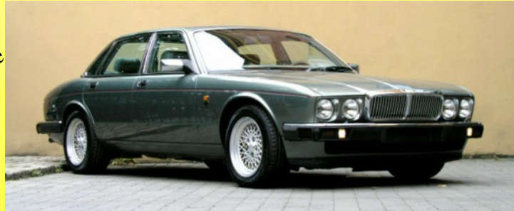
The launch of the Jaguar XJ6 (XJ40)

Prince Andrew, Duke of York marries Sarah Ferguson at Westminster Abbey.