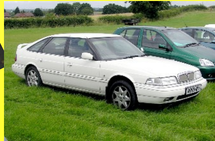
Austin Rover launches its new Honda-based Rover 800 executive car, which replaces the decade-old Rover SD1

Space Shuttle Challenger disintegrates 73 seconds after launch, killing the crew of 7 astronauts.