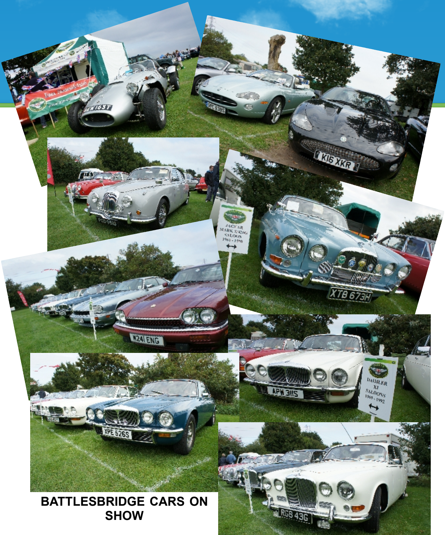
BATTLESBRIDGE CARS ON SHOW