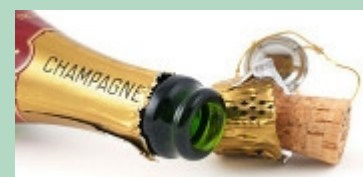
Rheims Champagne Houses - Proud of their traditions, the inhabitants of the Champagne region will gladly introduce you to the making of their mythical wine by taking you on tours of the wine cellar