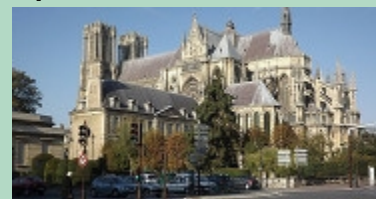
Rhims Notre Dame Cathedral - Notre-Dame Cathedral of Reims, the Gothic art masterpiece where the kings of France were crowned, was one of the