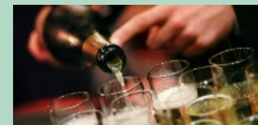
Champagne Houses in Épernay - A list of the Champagne houses in Epernay including Mercier and Moët & Chandon.....