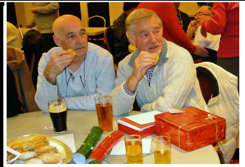
"Watch the birdie - no not that one!"

There are a number of events being planned for 2013. Those that attended Helmingham in Suffolk in 2012 were very impressed and the consensus was that we should return. This years show is to be held on Sunday 4 August. We also have our twice yearly show at Battlesbridge on the Sunday 12 May and Sunday 29 September. Cressing Temple Car Show is another favourite, but the date has yet to be announced. One new one spotted which looks interesting is the Pure Nostalgia Classic Car Event being held on Sunday 23 June 2013 at The Lawn Historic Country House, Rochford. Further details are being obtained. If any members have any knowledge of other shows worthy of the club attending, please let me know.