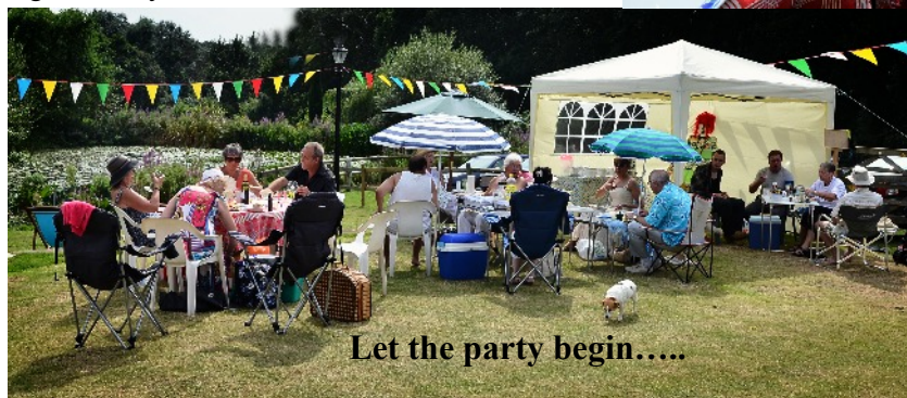
Let the party begin.....