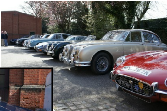
Members cars at Whitewebbs

The meal was good and reasonably priced but at times the service was