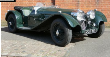
Richard Gibby's SS100 Rep.

somewhat slow due to lack of staff!!! Cut backs continually effect service in all businesses. However, a good day was had by all.