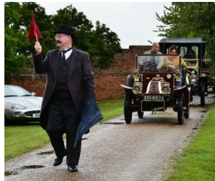
A bygone era!!

Showcasing some of the best vintage, classic and modern cars, motorcycles and military vehicles. There will also be 1940's dancers, entertainment, food and drink stalls. We attended this event last year in company with JDC Area 33 & 15 and had over 65 Jaguars attend, of which 25 were e-types there to celebrate the 50th anniversary. More details to follow nearer the time, but make sure you put your name down for this one.