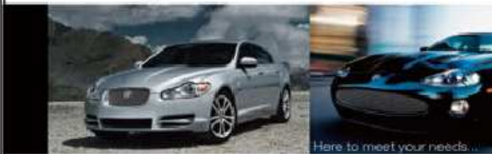
Here to meet your needs...

essex autogroup Rayleigh Jaguar Approved Service Centre