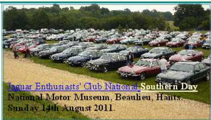
Jaguar Enthusiasts' Club National Southern Day National Motor Museum, Beaulieu, Hants. Sunday 14th August 2011.

Although some distance in the future, if members are considering a trip down to Beaulieu for the Annual Southern Day Show, perhaps you may wish to consider staying down for a long weekend. Now's the time to book a hotel as there are some good deals on at the moment. Jackie and I have booked the Holiday Inn Express in Adanac Park, Southampton (10.8 miles to the showground). For three nights accommodation and breakfast included, currently (Sunday 20th March) the rates are £159.00 - non refundable or £207 no charge for cancellation if notified within 2 days of arrival. This can be booked at www.booking.com . Making a weekend of it will allow you to explore the region.