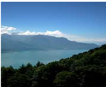
"Lake Geneva from Caux",

Lake Geneva: This crescent-shaped lake, formed by a withdrawing glacier, narrows around Yvoire on the southern shore, the lake can thus be divided into the "Grand Lac" to the east and the "Petit Lac" to the west. Lake Geneva is really just a part of the River Rhône, which rises at the Furkapass and flows westwards between the mountains of Canton Valais to enter the lake near Villeneuve. Its water takes an estimated seventeen years to cover the 73km to Geneva before flowing on through France into the Mediterranean near Marseille.