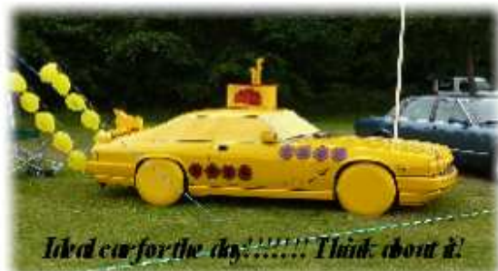
Liked car for the day!!!!!! Think about it!