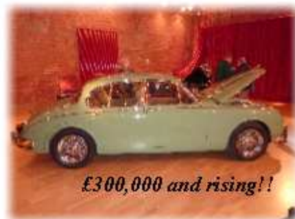
£300,000 and rising!!