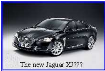
The new Jaguar XJ???