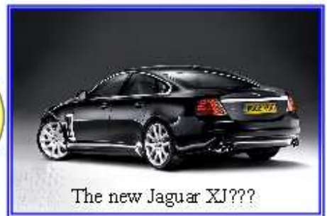
The new Jaguar XJ???