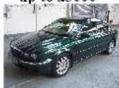
2003 Jaguar X-Type 2.5 V6 SE 118,000 miles S/H Inc. SatNav. £2,995 Call: 02 08 9927778