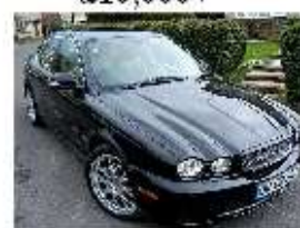
2008 Jaguar X-Type 3.0 SE SOVEREIGN V6 Auto SAT NAV/TV

14,896 miles. Price: £17,995 Classic Marques Ltd (01423) 563044