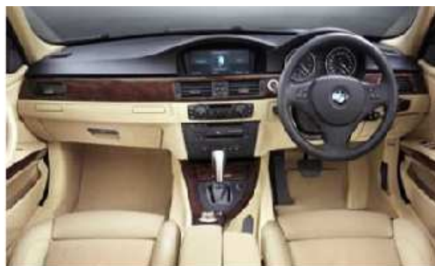
BMW 3 Series

Obviously on performance alone, the BMW wins hands down. However, looking at the current specifications overleaf, Jaguar is including over £4,000 worth of BMW's extras within its £25,472 price tag. This cannot be ignored!