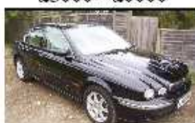
2003 Jaguar X-Type 2.0L SE Auto Petrol 23,100 miles, s/history. £5,595 Call (0208) 9538483