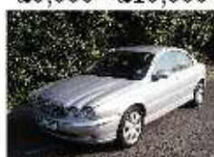
2005 Jaguar X-TYPE 2.0 L V6 SE Auto. 27,000 miles £7,990 Call (0208) 9890001