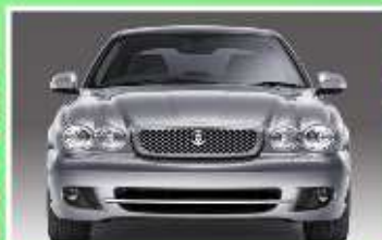
THE 'NEW' 2008 X-TYPE