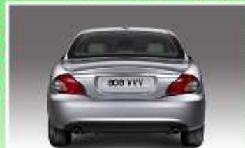
MORE DETAIL INSIDE